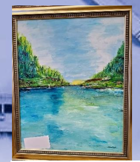
Alene Bynum "Early Morning Stillness"