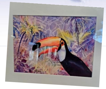
Virginia Potter "Toucan Party" Faulkner County Library A&B