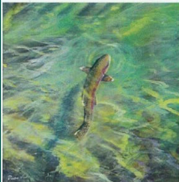
Duane Hada, Rainbow at Surface , acrylic on canvas