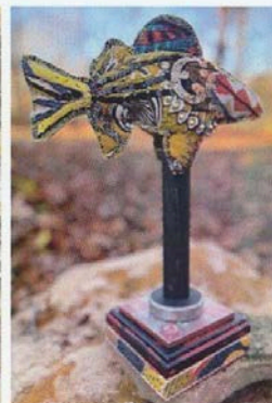
Annie Helmericks-Louder Fish #14 , textiles and mixed media